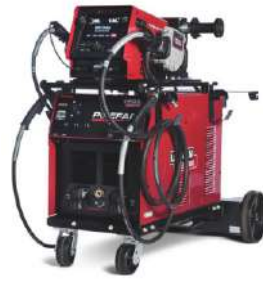
PIPEFAB READY-PACK K3734-1