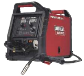
POWER MIG 211i MIG WELDER K6080-1